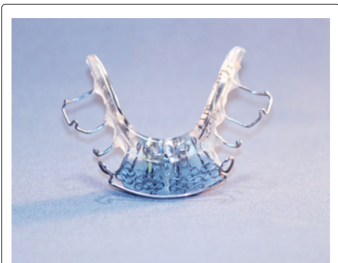
Figure 3: A lower biomimetic appliance (DNA appliance ® ) with anterior 3-D axial springs TM , a midline screw, retentive clasps and a labial bow that was prescribed for the non-mandibular advancement half of the study population.

between 1 to 3 months after the upper appliance unless the subject was wearing the biomimetic appliance design that incorporated the mandibular repositioning nighttime component at the outset (Figure 2). Every 3 months, the overnight sleep studies were repeated. The post-treatment sleep tests were done with no appliance in the mouth and were interpreted by a medical physician. The mean apnea-hypopnea index (AHI) of the study sample was calculated prior to and after BOAT, and the findings were subjected to statistical analysis, using paired t-tests.