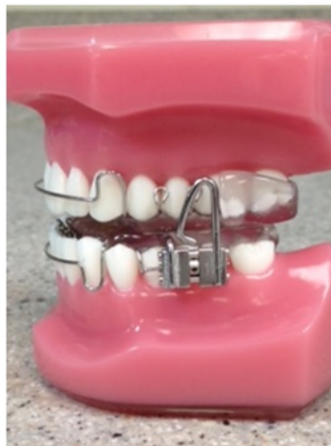
Figure 2: The mandibular repositioning nighttime appliance (mRNA appliance®) that was prescribed for the other half of the sample with: anterior 3-D axial springs™, a midline screw, bilateral occlusal coverage, retentive clasps, a labial bow and a lower mandibular advancement component.

blinded in terms of appliance allocation. BOAT is designed to address upper airway deficiencies and to correct maxillo-mandibular hypoplasia in both children and adults [9-17]. All biomimetic oral appliances used in this study had: 6 anterior 3-D axial springs™, a beaded pharyngeal extension, a midline screw, bilateral occlusal coverage, retentive clasps, and a labial bow (Figure 1), but only half of the biomimetic appliances incorporated a mandibular repositioning nighttime component (Figure 2).