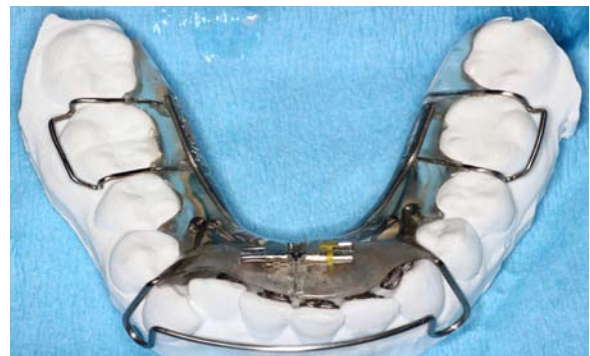
Figure 1b: The lower acrylic-based Daytime-Nighttime Appliance (DNA appliance®) that was used in this study consisted of: 6 (patented) anterior 3-D axial springs™; a midline jackscrew; bilateral retentive clasps, and a short labial bow with U loops.

appliance during the evening and at nighttime (for approx. 12-16hrs. in total), but not during the day time and not while eating, partly in line with the circadian rhythm of tooth eruption [17] although this only occurs in children. Proffit [18] notes that an appliance needs to be worn for at least 8hrs. in the mouth to have a clinical effect. Written and verbal instructions were given to all subjects.